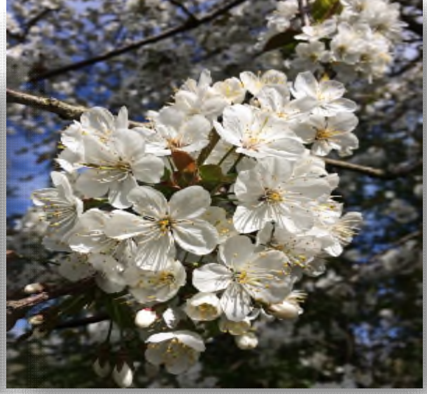
All pictures in this document are courtesy of Adam Bows, Spring 2020